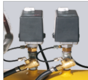
Dual pressure switches Dual pressure switches vent the compressors for unloaded starting. The cut-in and cut-out pressures can also be individually set.