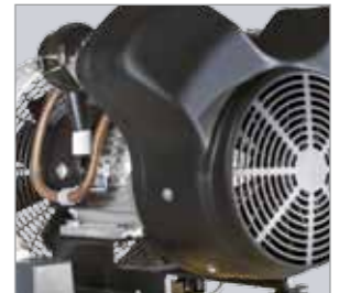
Dual cooling Optimum cooling with double-stream airflow.