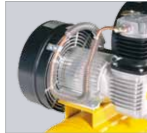
Directly coupled unit coupled to the compressor block. Low speed operation of only 1500 rpm ensures maximum reliability and extended service life.