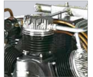
Highly effective cooling Aluminium cylinder heads provide exceptional heat dissipation to ensure extended service life.